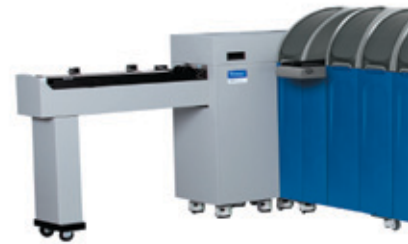
Datacard® MXD™ Lite card delivery system

The Datacard® MXD™ Lite card delivery and Datacard® MXi™ envelope insertion systems seamlessly integrate with the MX1000 system to enhance your overall card operations. In one automated process, you can affix cards and add marketing insertions into an envelope for a complete card-to-envelope solution.