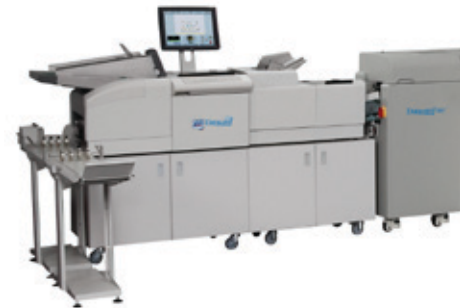
Datacard® MXi™ envelope insertion system